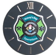
Full Colour UV