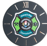
Full Colour UV